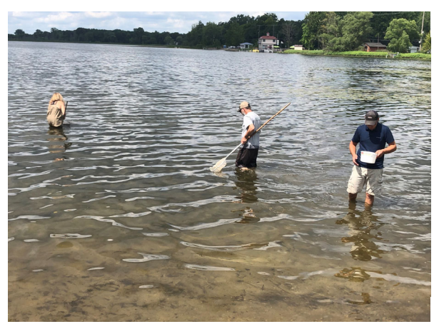
The Introduction to Lakes Online course was created by MSU Extension Educators and faculty members in the MSU Fisheries and Wildlife Department. Since 2015 over 1,500 people have enrolled in the course.

Aquatic invasive species are often spread unintentionally on boats and trailers. Once introduced, they are difficult and expensive to manage.