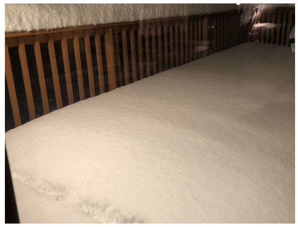
MSU Extension's Cabin Fever Conversations provides a needed space for lighthearted and informal conversation about all things gardening while forces outside our control keep us in.